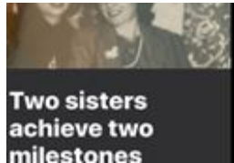
Two sisters achieve two milestones